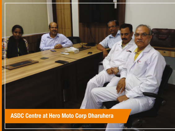
ASDC Centre at Hero Moto Corp Dharuhera