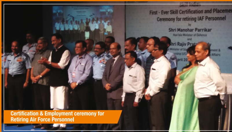
Certification & Employment ceremony for Retiring Air Force Personnel