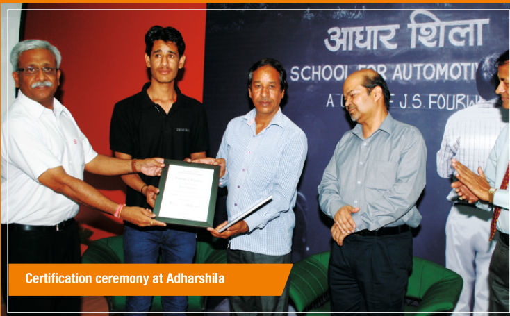
Certification ceremony at Adharshila