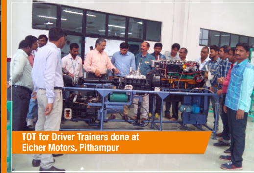
TOT for Driver Trainers done at Eicher Motors, Pithampur