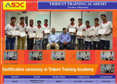
Certification ceremony at Trident Training Academy