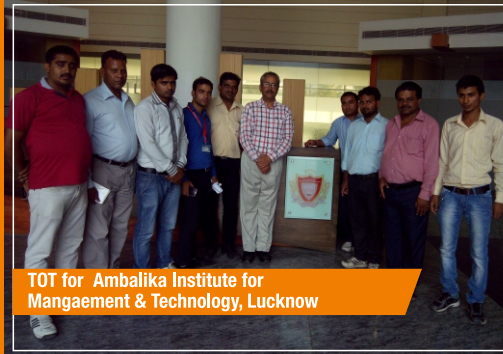
TOT for Ambalika Institute for Management & Technology, Lucknow