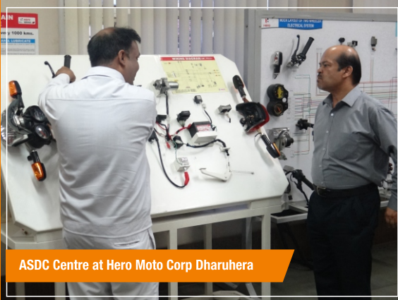
ASDC Centre at Hero Moto Corp Dharuhera